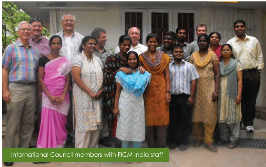
International Council members with FICM India staff