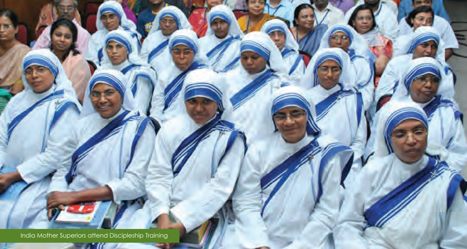
India Mother Superiors attend Discipleship Training