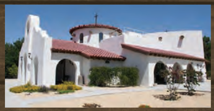
Setting Your Church Free site

When many people think of freedom, they think of individuals going through The Steps to Freedom in Christ . After all, the "Steps" is an important part of what FICM is all about. But have you ever thought about a church needing a "freedom appointment" too?