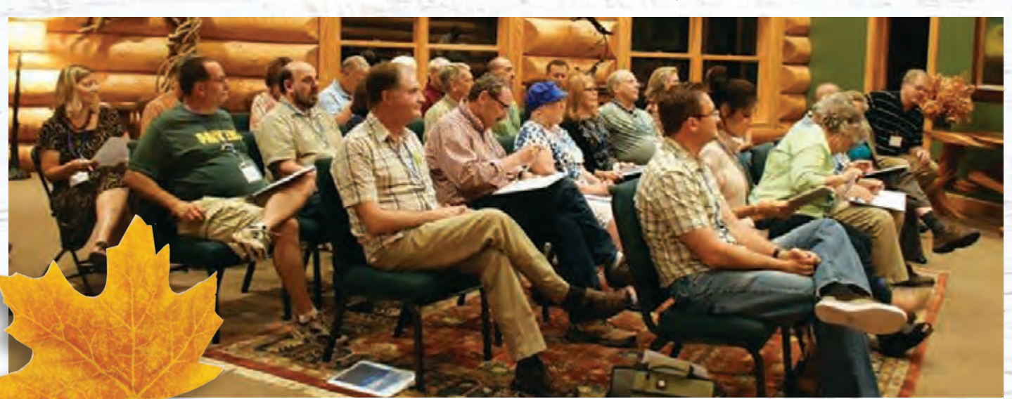
Discussing the future of FICM-USA