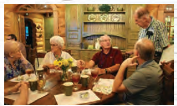
Fellowship over meals