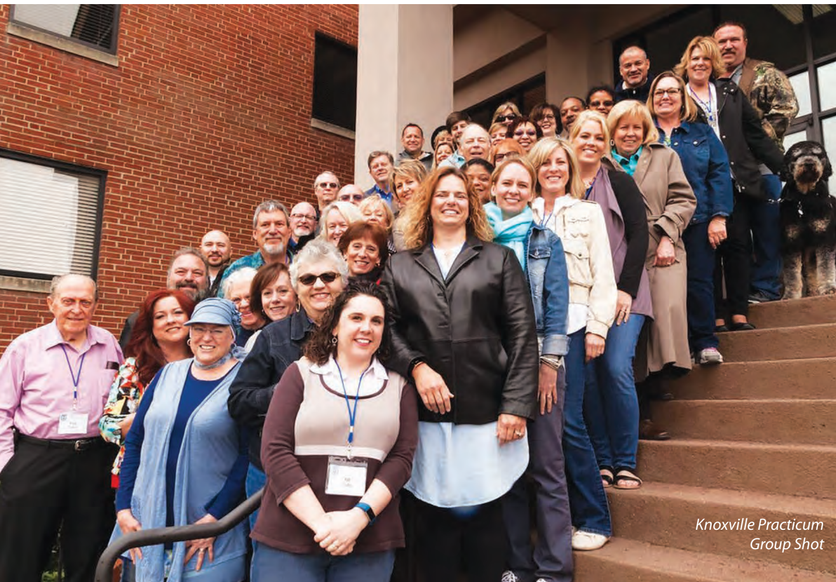
Knoxville Practicum Group Shot

The advantage of having Practicums in Knoxville is that our home office staff is there to provide all the behind-the-scenes labor. And they do an outstanding job. They procure the venue, put together all the notebooks as well as the book table; communicate with the students all through their online studies; set up hotel lodging; purchase, prepare and clean up the massive amounts of food and beverages consumed by almost 50 people at this Practicum. And much more. They make it a five-star equipping event. Here are some comments from Knoxville