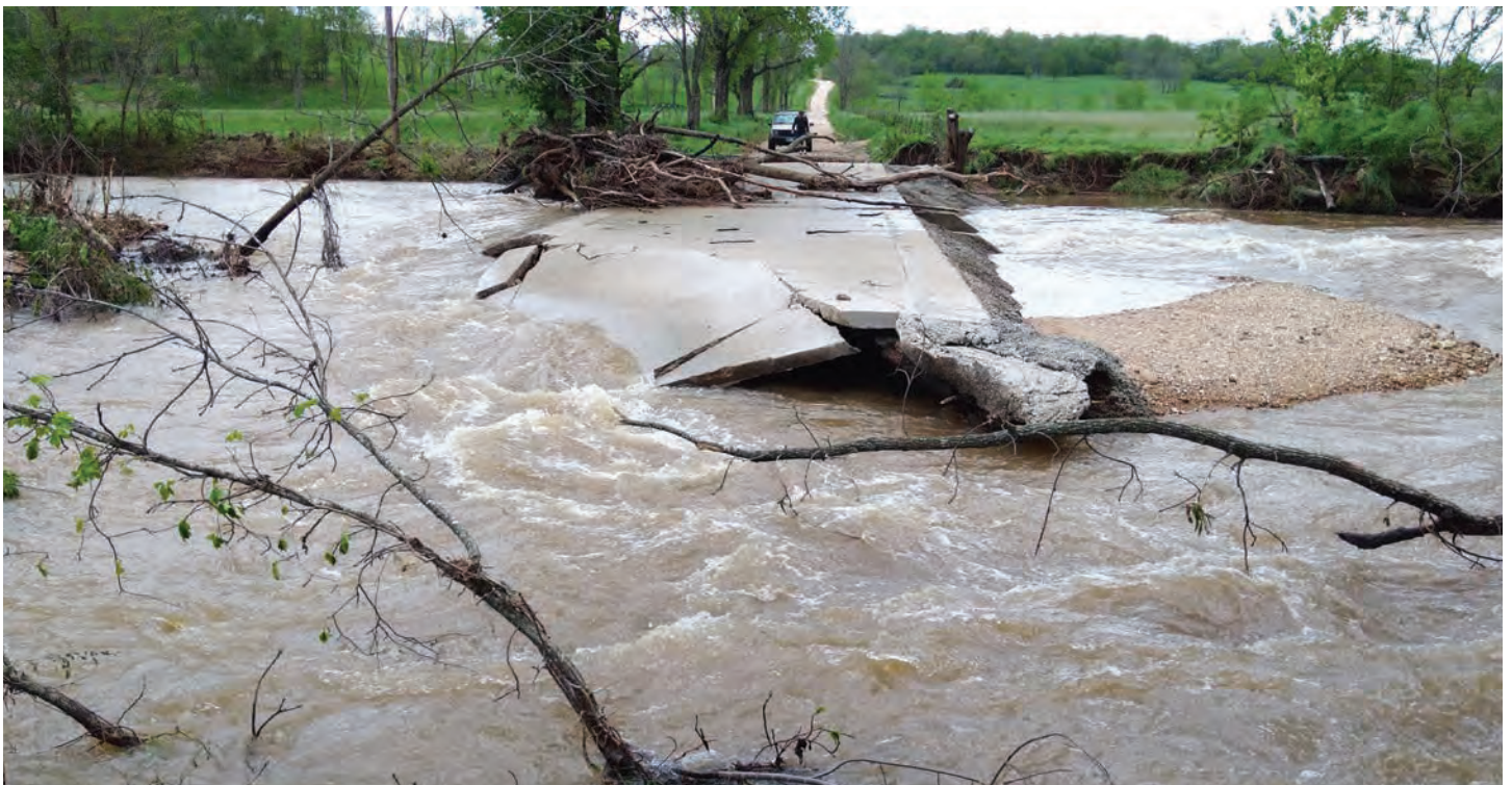
Bridge out due to heavy flooding.