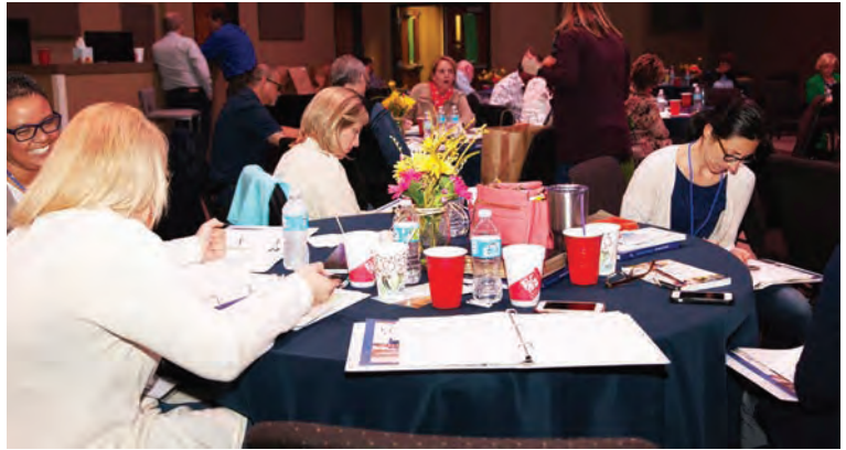
Training Workshop at Knoxville Practicum

"I came focused to learn about process: training on how to start a ministry. I questioned my own need to go through The Steps to Freedom in Christ again. In my appointment, in Step 7 (Curses vs. Blessings), a big, huge layer came off of me. The Lord was there; I've been healed greatly!"