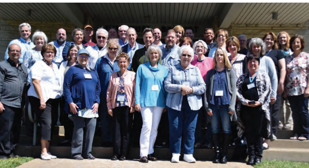
Springfield, Missouri Practicum staff & participants

The sidebar to this article provides a small taste of the impact of the Spirit of the LORD on God's people during this very strategic event. Please be praying for many wide-open doors for our people to develop long term, fruitful ministries in churches all around the Midwest as the result of the Practicum.