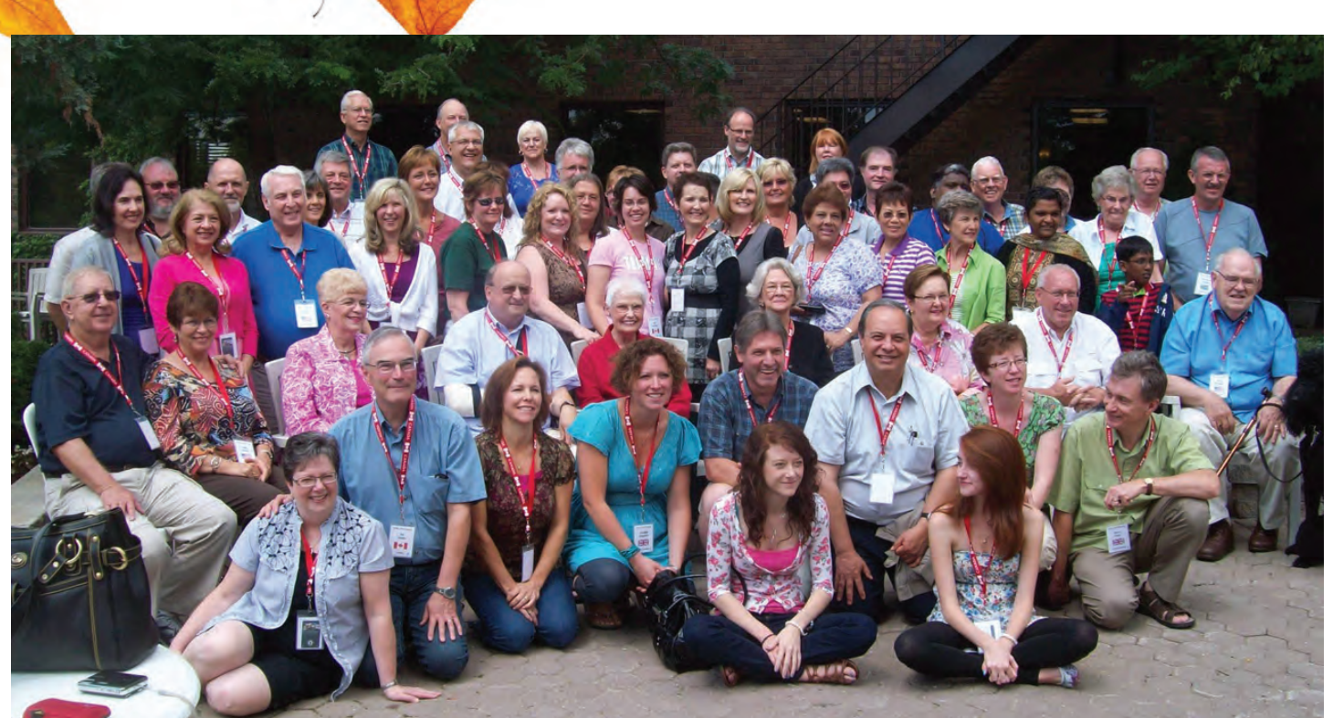
FICM International Staff and Families